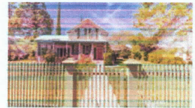
Sutter Creek Inn