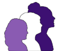
Job's Daughters CALIFORNIA