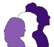
Job's Daughters CALIFORNIA

Chico-Leland Stanford Lodge #111 1110 W. East Ave Chico, CA 95926