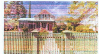
Sutter Creek Inn