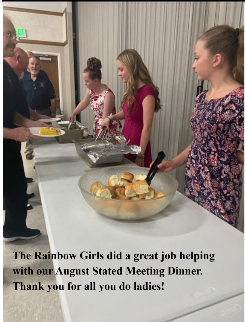
The Rainbow Girls did a great job helping with our August Stated Meeting Dinner. Thank you for all you do ladies!