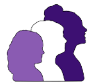
Job's Daughters CALIFORNIA

Chico-Leland Stanford Lodge #111 1110 W. East Ave Chico, CA 95926