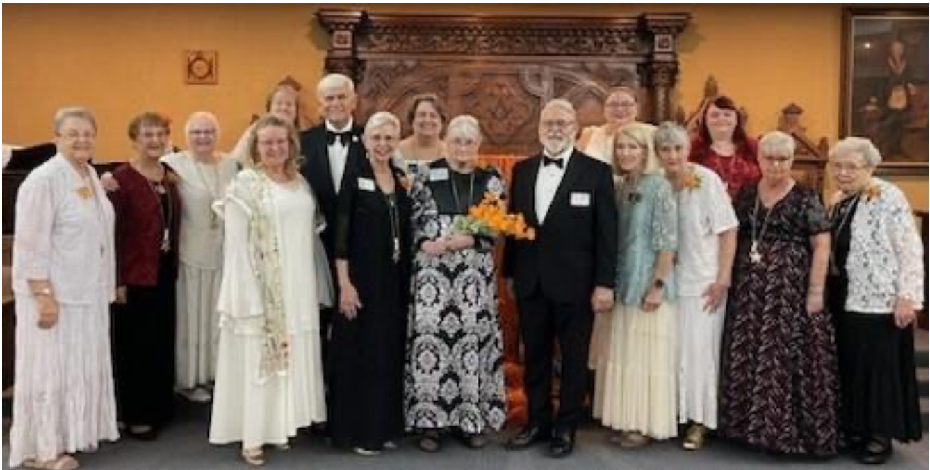
Eastern Star: The 134th Installation